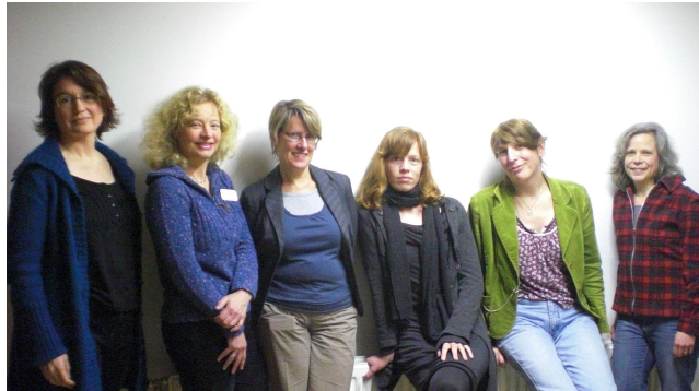
Greetings from the Board of Directors of Vrouw en Muziek in the Netherlands